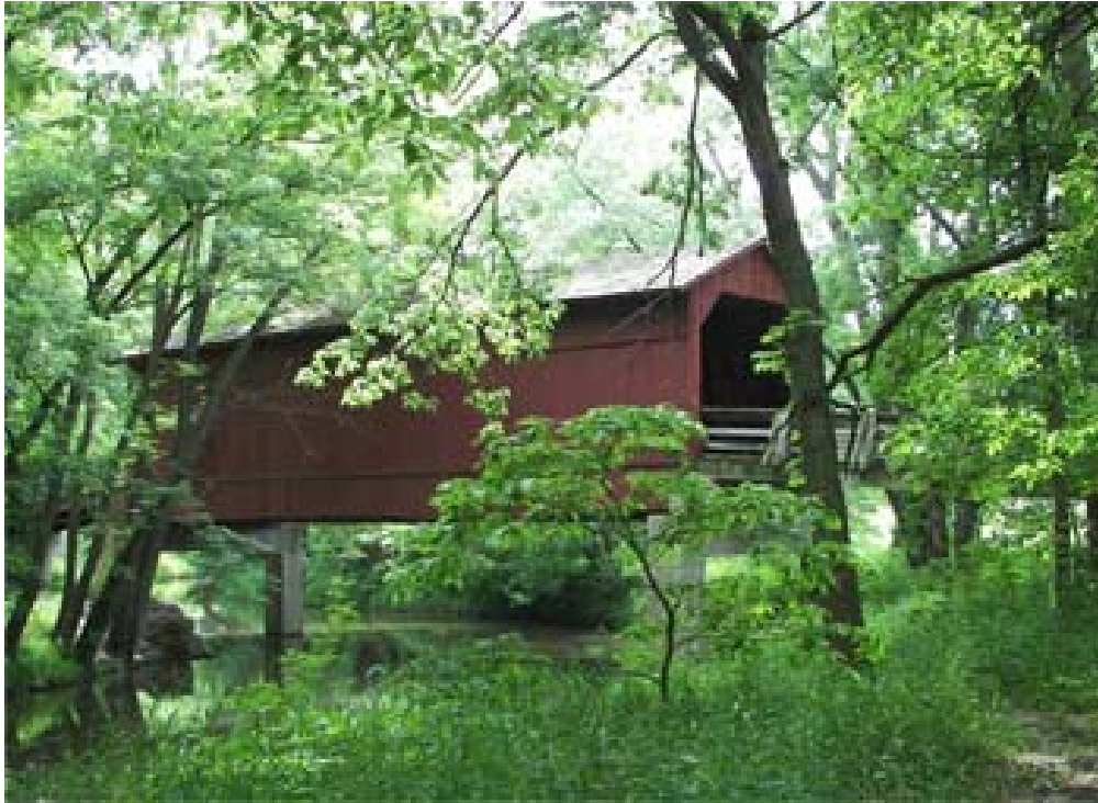
Sugar Creek Bridge

Amateur photographers can submit 11"X14" or smaller photographs taken within Washington Park and matted on 11"X14" foam core board. The categories are Adult, Young Adult, and Junior. All entries must be at the Botanical Garden by April 20. For info, and detailed rules, call 753-6228.