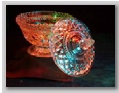
Light and Glass by Eldon Muench