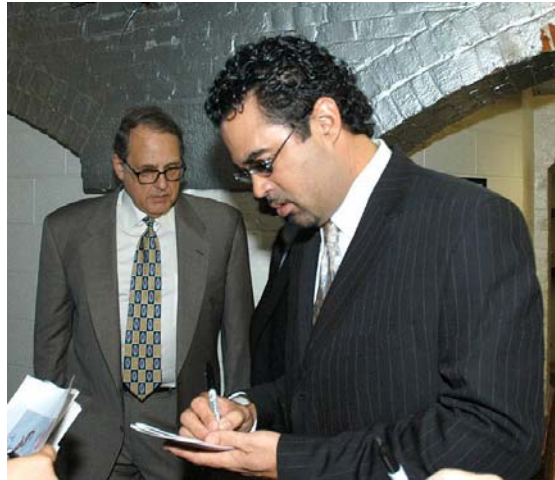
White Sox Manager Ozzie Guillen signs an autograph at the State Capitol— behind Ozzie is Jerry Reinsdorf, owner of the White Sox and the Chicago Bulls.