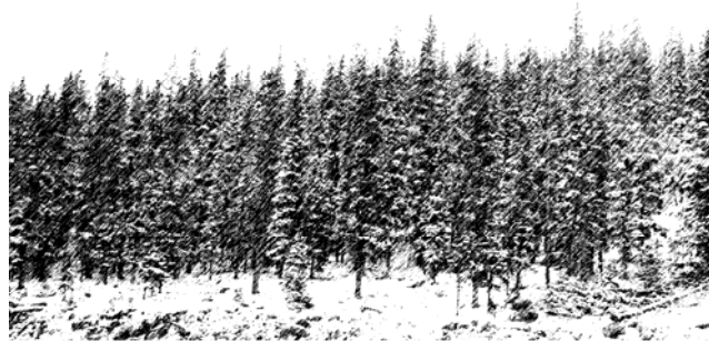
Snowy Trees in Rocky Mountain National Park