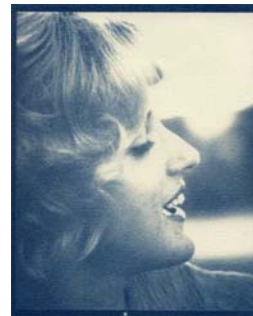
Cyanotype by Gregor Moe

XXXXXXXXXXXXXXXXXXXXXXXXXXXXXXXXXXXXXXXXXXXXXXXXXXXXXXXXXXXXXXXXXXXXXXXXXXXX