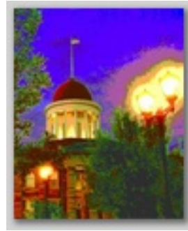
Old State Capitol by George Hind