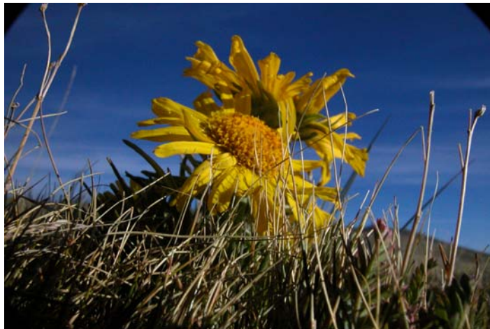
Rocky Mountain Wildflower

They used to photograph Shirley Temple through gauze. They should photograph me through linoleum. Tallulah Bankhead (1903 - 1968)