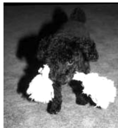
Playtime for Dog

Oh, by the way, the photo's caption????..... "What Michelle Pfeiffer Needs ....Is Absolutely Nothing."