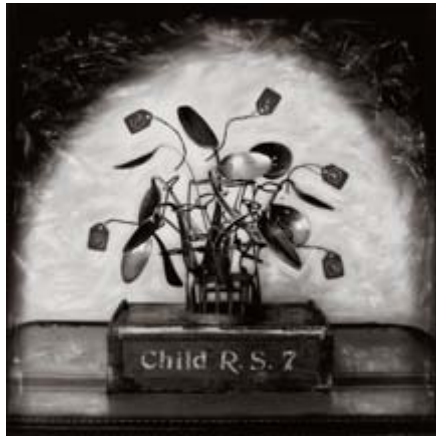
Bending Spoons 1st Prize Winner

Review Santa Fe is for photographers who have created a significant project or series and would like to meet with industry leaders. The event consists of portfolio reviews with renowned photography professionals, a night of portfolio sharing , and more.